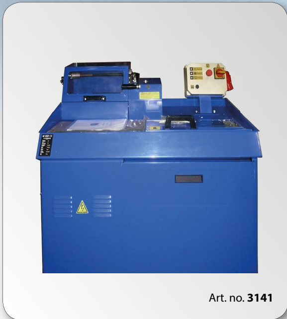
Art. no. 3141