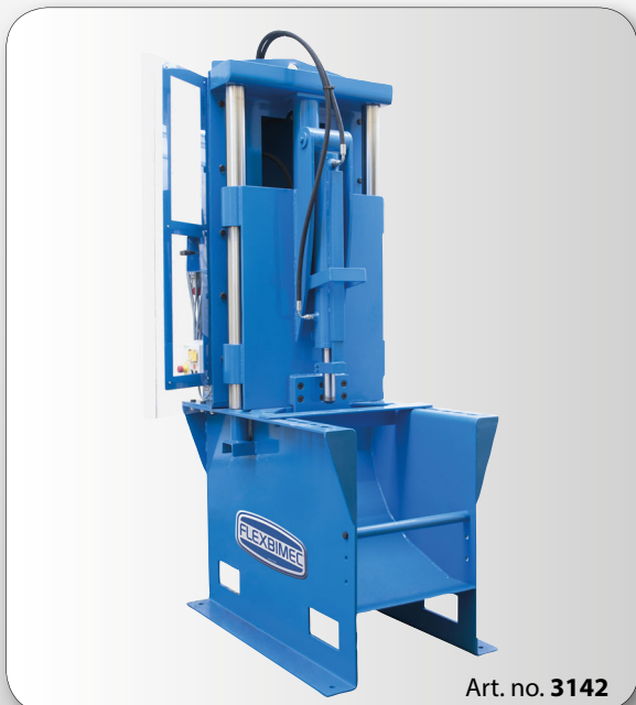
Art. no. 3142