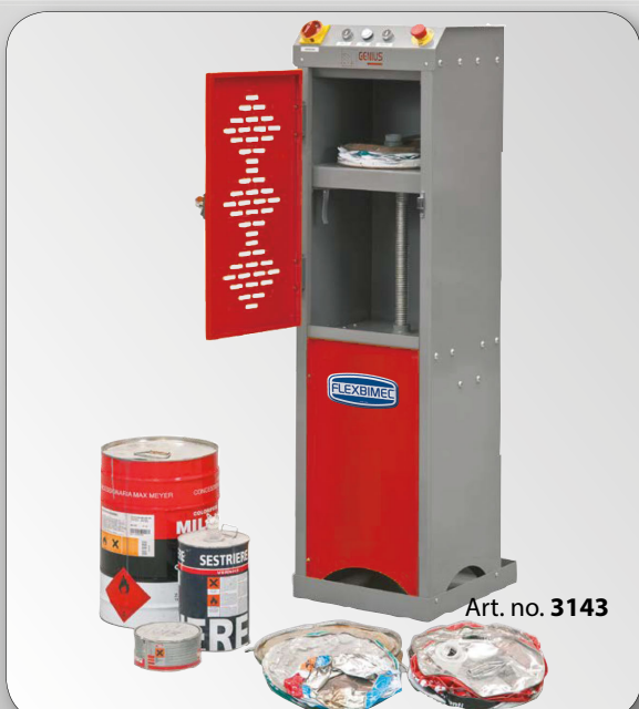
Art. no. 3143