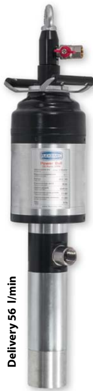
Delivery 56 l/min