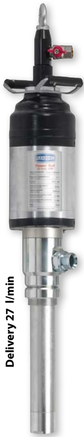
Delivery 27 l/min