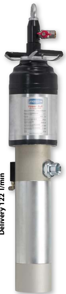
Delivery 122 l/min