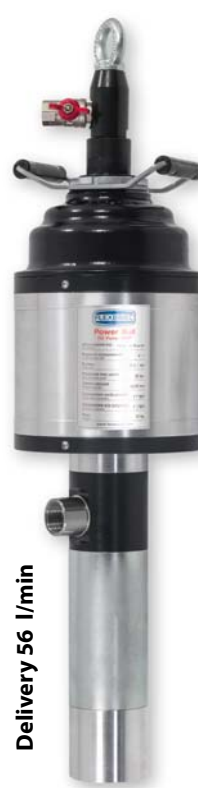
Delivery 56 l/min