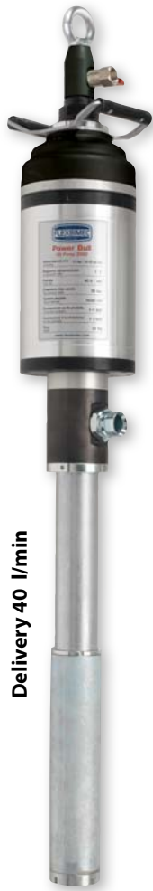
Delivery 40 l/min