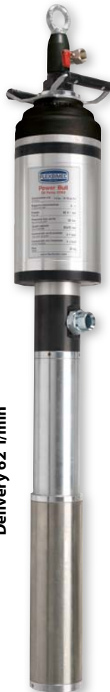
Delivery 62 l/min