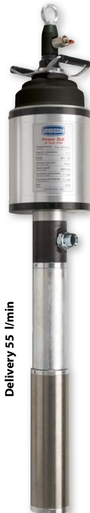
Delivery 55 l/min