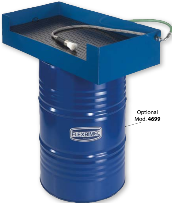
Optional Mod. 4699