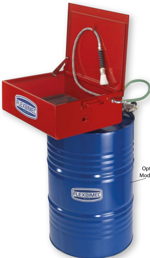
Optional Mod. 4699