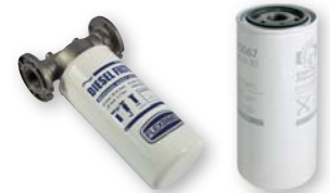
Art.no. 6600 Art.no. 6603